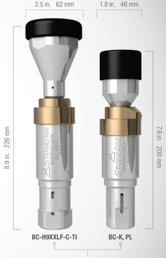
9/16 HP, 9/16 MP